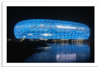
Allianz Arena Munich

09.45 a.m. Depart Berlin on return flight (TXL) to U.S.