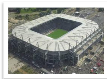
Borussen Park Mönchengladbach