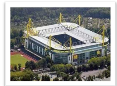
Signal Iduna Park – Dortmund